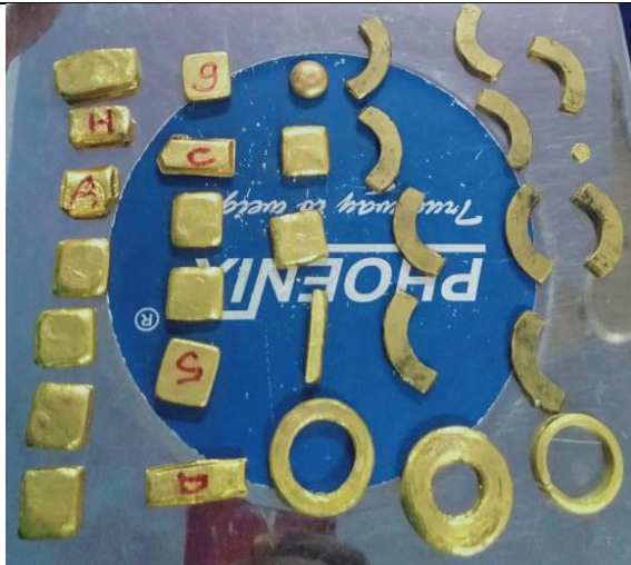
S.No.11 Gold Ingots (Assorted)-24Kt