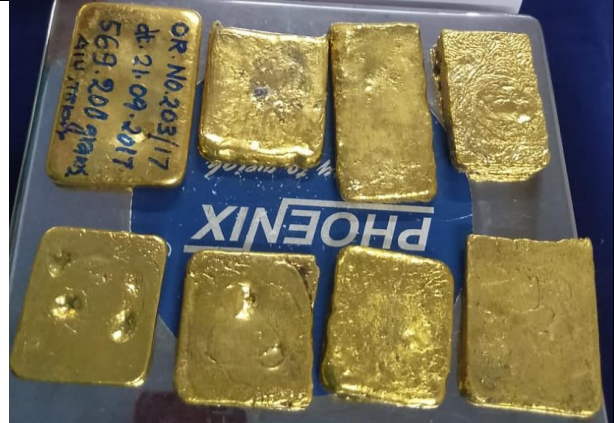
S.No.8 Gold Ingot Rectangular Shaped-24Kt