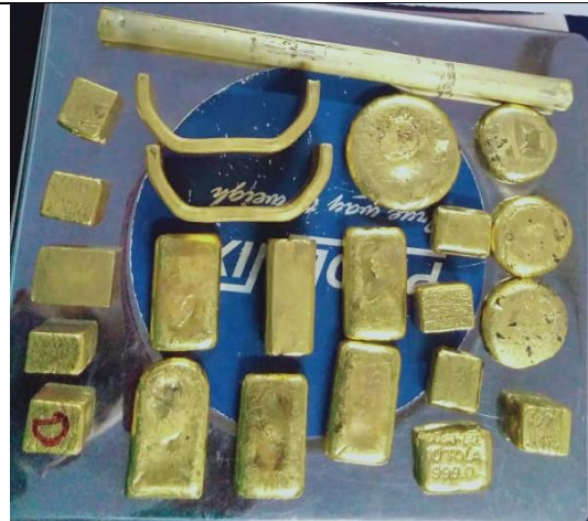
S.No.10 Gold Ingots cut pieces (Assorted)-24Kt