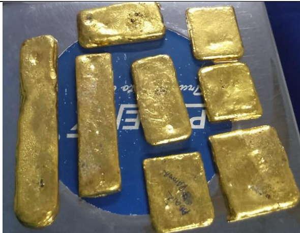
S.No.9 Gold Ingots Sq & Rectangle shaped-24Kt