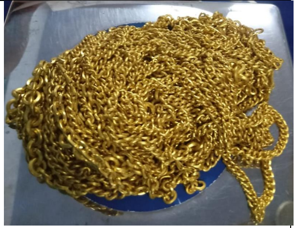
S.No.14 Short & Medium Unfinished chains-24Kt