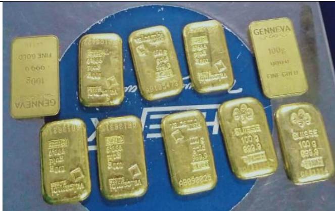
S.No.5 100 Grams Bars 999.9