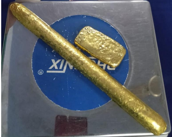
S.No.15 Gold Ingot Rod & Rectangular-24Kt