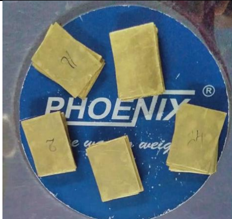
S.No.3 Rectangle Shaped Gold Sheet-24Kt