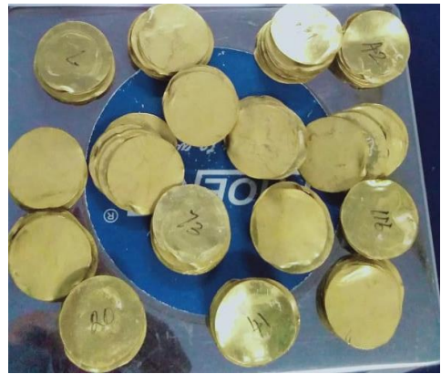
S.No.2 Round Shaped Gold Sheet-24Kt