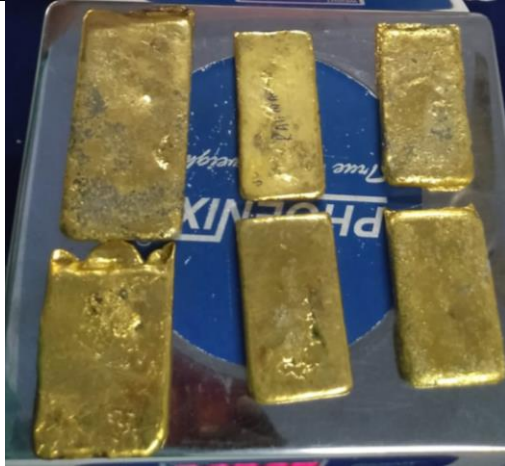
S.No.7 Gold Ingot-24Kt