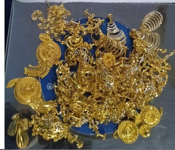
S.No.19 Gold Earrings & Finger Rings -22Kt