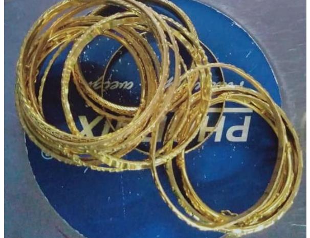
S.No.16 Gold Bangles-22Kt