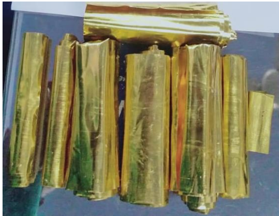
S.No.1 Rolled Gold Foil – 24Kt