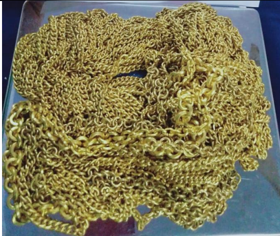
S.No.13 Long & Medium unfinished Chains-24Kt