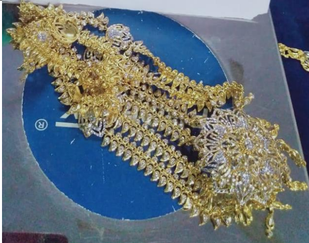
S.No.17 Gold Long Haram-22Kt