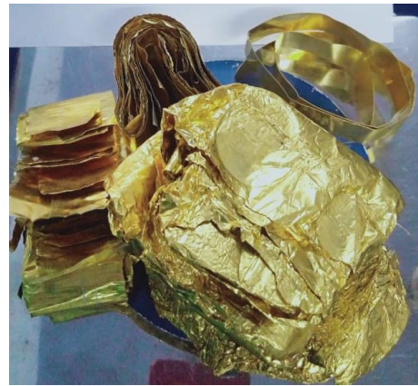
S.No.4 Gold Foil -24Kt